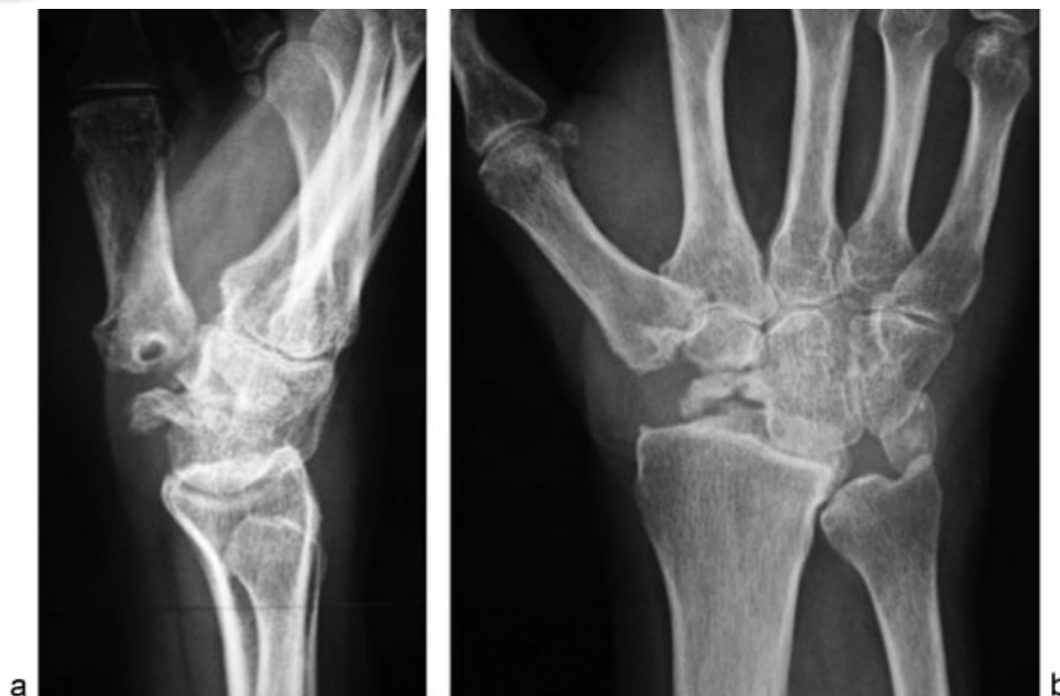
Fig. 3 (a,b) Trapeziectomy and PRC with arthrodesis of the distal pole of the scaphoid at the capitate plus styloidectomy.

There was one case of Eaton 4 stage 2 and 10 cases of Eaton stage 3 thumb basilar joint arthritis. In this classification, stage I comprises normal articular surfaces without joint space narrowing or sclerosis. There is less than one-third subluxation of the metacarpal base. Stage II reveals mild joint space narrowing, mild sclerosis, or osteophytes < 2