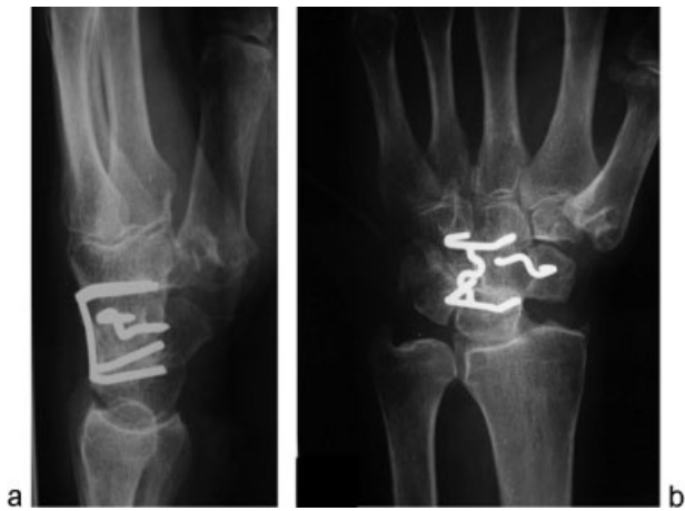
Fig. 2 (a,b) Trapeziectomy and four-corner arthrodesis (arthrodesis of the distal pole of the scaphoid to the capitate) + styloidectomy.

arthroplasty (Maïa, Groupe Lépine, Genay, France) in six cases (group B). At the same time a posterior interosseous nerve (PIN) resection was performed.