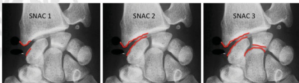
Fig. 7 SLAC wrist classification.

Our series shows active ranges of motion comparable to those in the literature, with a flexion/extension range of 64° following four-corner arthrodesis and 75° following PRC, but grasp strength is clearly lower compared with the results found in the literature (55% in our series versus 75%). The association of these two arthritic locations easily explains this loss of grasp strength. However, the absence of difference in pinch strength and Kapandji score regarding the trapeziectomy or isolated TMC arthroplasty series makes us think that the treatment of wrist arthritis does not influence the result of treating thumb basal joint arthritis. The influence of preserving the distal pole of the