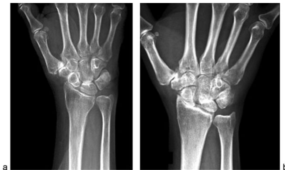
Fig. 1 Preoperative X-ray images: (a) SLAC III and (b) Stage 2 thumb basal joint arthritis.

A Gedda-Moberg approach was done in all cases. This approach follows the line of the abductor pollicis longus (APL), which is retracted palmarly and the terminal branches of the superficial radial sensory nerve are identified. Then the thenar muscles are reflected subperiosteally. The carpometacarpal (CMC) joint capsule is identified and incised. With this anterolateral approach, it is easier to remove the distal scaphoid. The TMC joint arthritis was treated with a total trapeziectomy combined with a suspension ligamentoplasty using the APL in five cases (group A) and a TMC implant