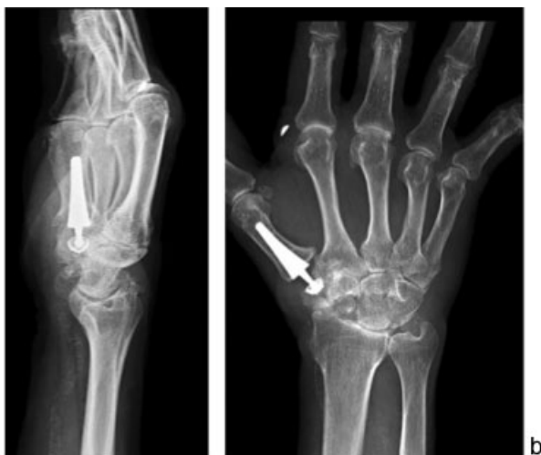
Fig. 5 (a,b) Trapeziometacarpal arthroplasty and PRC.

Our institution does not require institutional review board (IRB) approval.